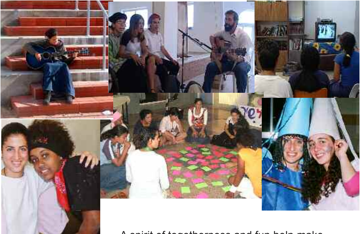
A spirit of togetherness and fun help make the years spent at Ulpanat Dolev a positive turning point in a young girl's life.