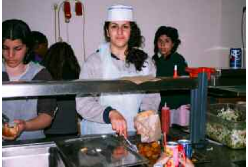
Cosmetology and catering are just a few of the vocational skills taught at Ulpanat Dolev.