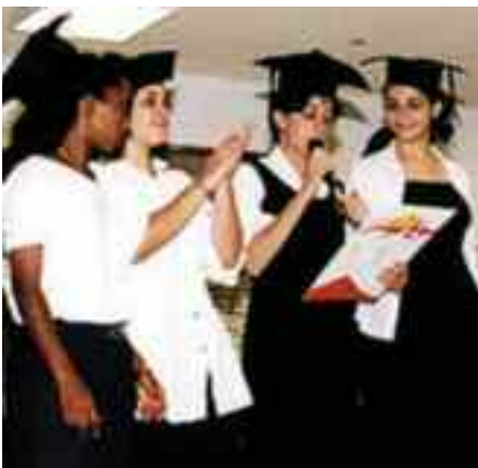
A ceremony and a show mark Graduation Day at Ulpanat Dolev.