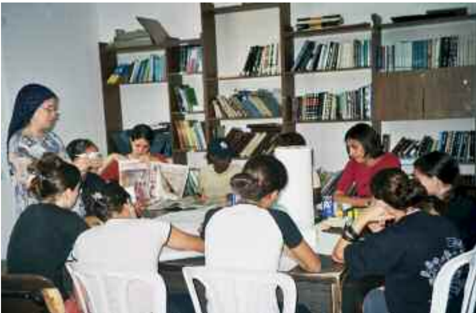
An art class on campus allows the students to explore their creative sides.